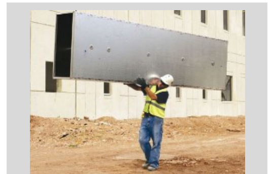
Pro-R Indoor is a lightweight phenolic duct solution suitable for interior applications.